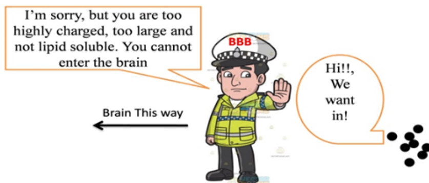
Figure 1: Schematic role of BBB

as between blood vessels and the brain. So this BBB due to its neuroprotective role not only blocks the unwanted stuff to get in to the brain but also any drug molecule.